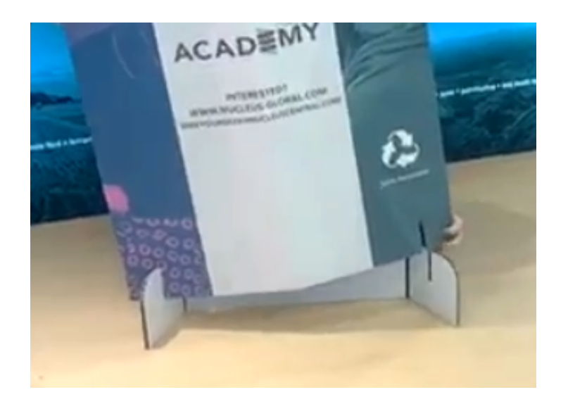
Step 2 Slot banner cut outs and base cut outs together.